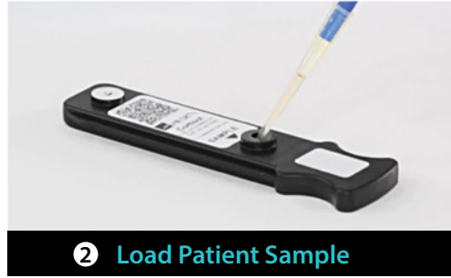
2 Load Patient Sample