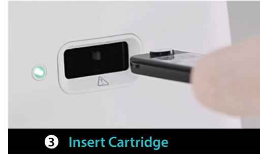
3 Insert Cartridge